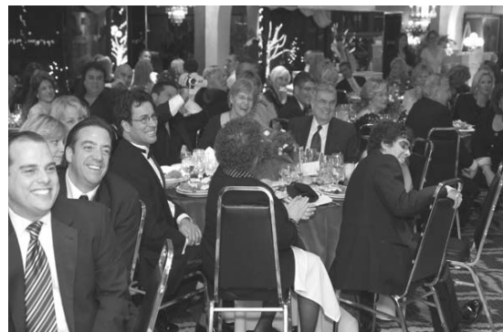
A good time was had by all at the 2007 Winter Glow Ball

For more information call 732-493-1919 or go to www.arcofmonmouth.org .