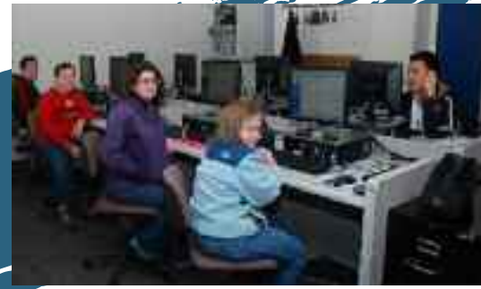
Members of the Kach program at Brookdale

A major achievement of the department was the founding of the Keep Achieving at Brookdale (Kach) program funded by a grant awarded by The Arc of the United States from funding from the