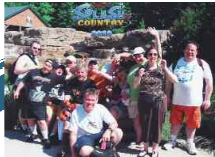
Participants of the May 2010 group trip to Pigeon Hole, Tennessee

Within certain trips there are many achievements. Served individuals are included in the planning, shopping, cooking and chores that come with renting a home for a week (as opposed to a hotel). This involvement provides lessons in healthy eating, budgeting and skill building.